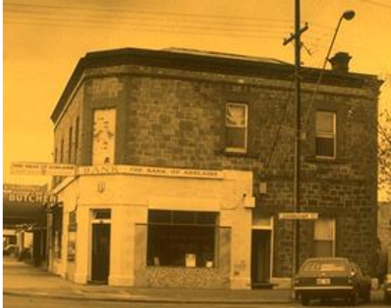
(CD Ref 1725/60)

157 Melbourne Street North Adelaide No. 58