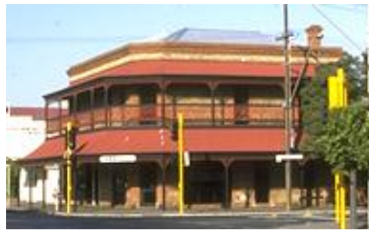
(CD Ref 1725/58)

The former shop is of great environmental significance, its scale and style making it highly distinctive, especially with its prominent corner location. The two storey building complements the Old Lion Hotel on the opposite corner, and both make a major contribution to the character of this area.